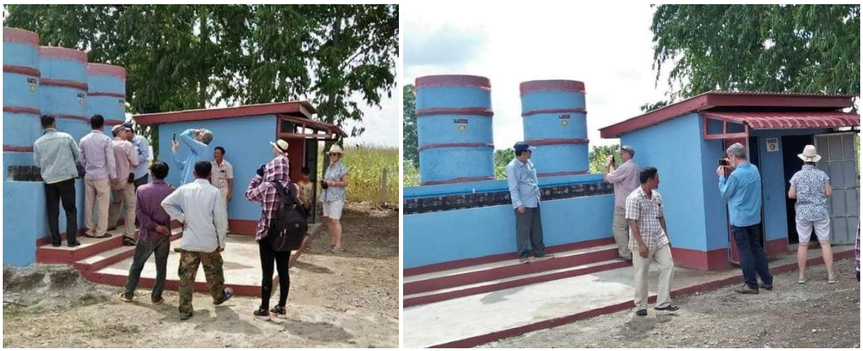
We have a great honor to be visited by our support Rotary Dalkeith members from Australia

Finally, a pump well, a hand washing plot and a school toilet were completed build and using by local villagers and local schoolchildren