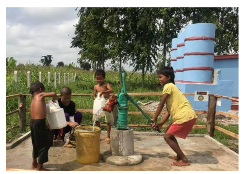
Finally School and Community Children are happy with their water

At the same time, School hand washing and School toilet were started to build,