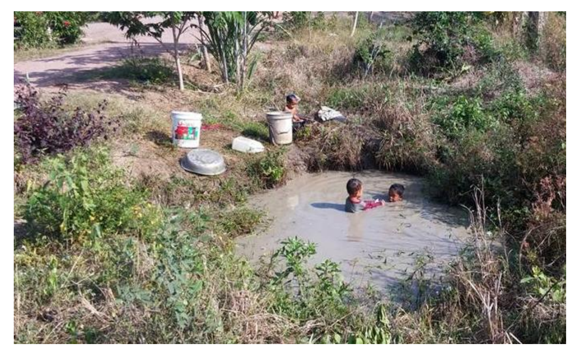
Some children are at home with their sibling while their parents are working in the field

During his visits, he also found that water and sanitation of a primary school in this village need renovated as well.