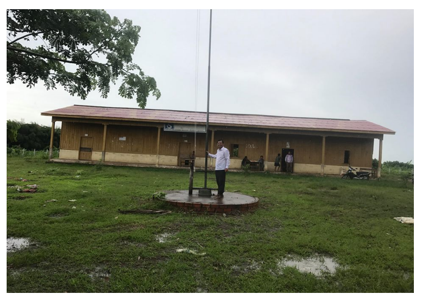
Rural road to project implementation site