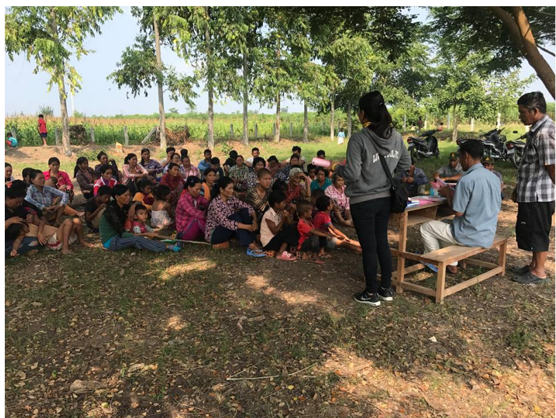
Self-help group established

CFS encourage villagers of this village to establish self help group SHG. The main objective of establishment self help group was to promote rural family to live together in peace, help each other, share their local resources and especially saving monies for further needs including maintenance water pump well, school hand washing and school toilet which were already renovated.